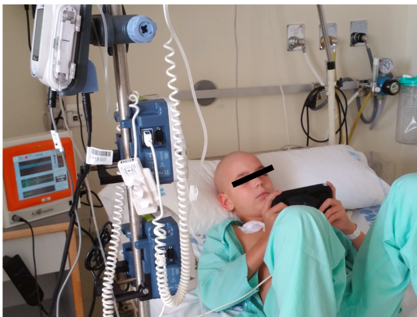
Figure 1. Child playing an electronic video game while being fitted with a patient-controlled analgesia pump and monitored for respiratory heart rate variability.

The study was approved by the Ethics Committee at La Paz University Hospital on May 21, 2015 (code: PI-1217).